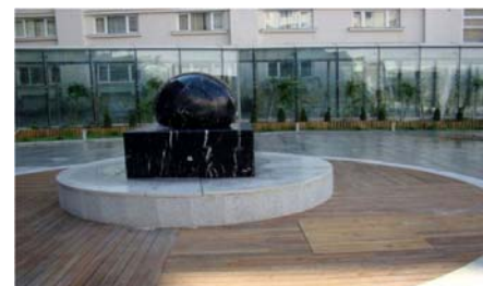
A water feature contributes to ease and relaxation of the guests.