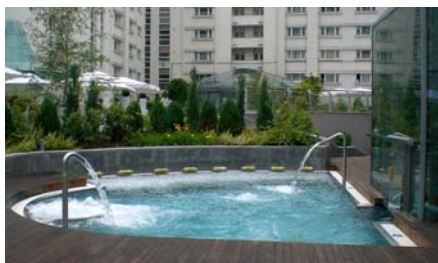
Europe's largest outdoor whirlpool is situated in the Radisson Hotel courtyard.