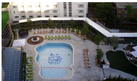
The heated outdoor swimming pool is located on the underground parking garage of the hotel.