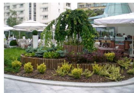
An integrated automatic irrigation system in the planting beds ensures adequate water supply of the plants.