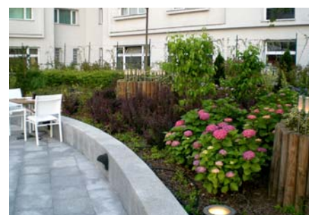
Curved planting beds with various small plants, shrubs and trees are built along the walkways.