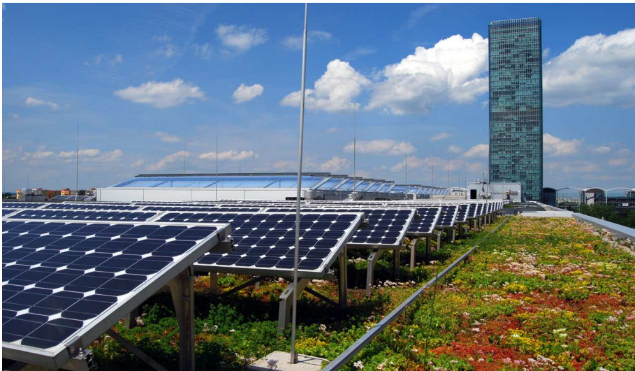
Solar system combined with the fall protection system Fallnet® Rail.