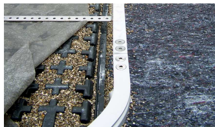
In addition, a rail system was attached to the SB 200 boards to protect against falls.