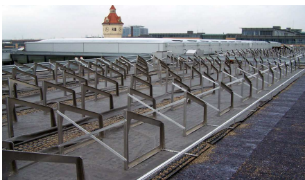
Each Solar Base Frame has been mounted on a 2 m 2 Solar Base Plate SB 200.