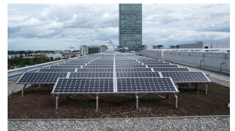
The solar panels were mounted almost to the roof edge in order to maximise the available roof area.