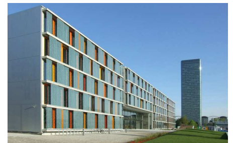
External view of the Munich Technology Centre (MTZ).

Because the solar panels were set up almost to the edge of the roof the additional fixing device Fallnet® SB 200 Rail was installed which allows for safe working in the perimeter areas.