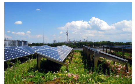
Because a green roof has a significantly lower surface temperature than a blank or graveled roof, the photovoltaic module remains cooler over a green roof and thus a high power outcome is maintained.